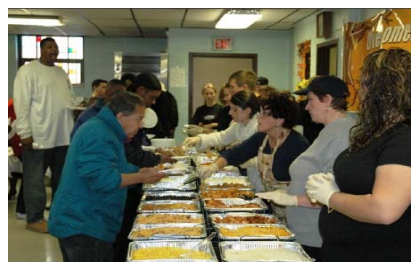
Lots of volunteers serving food & love

The first time I spent my Thanksgiving at the Marathon meeting I was really shocked at the number of people who spent their holidays alone or without food. The Marathon Meeting has become like a family Thanksgiving, not only for me but everyone else who attends. I see people who I have not seen since the last Thanksgiving.