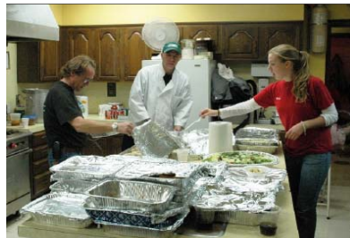
Meal preparation in the kitchen

the Marathon Meeting and all that it accomplishes even more. I am very involved in holidays. I love family, friends, and I love tons of food.